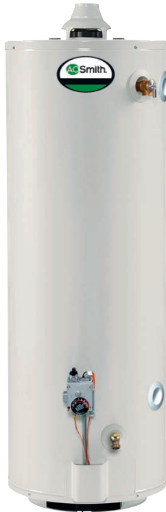
All ProMax SL water heaters are equipped with side-mounted recirculating taps.