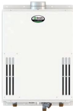
Heavy-Duty Commercial Gas Models